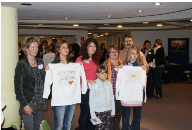
Proud children winners in the drawing competition