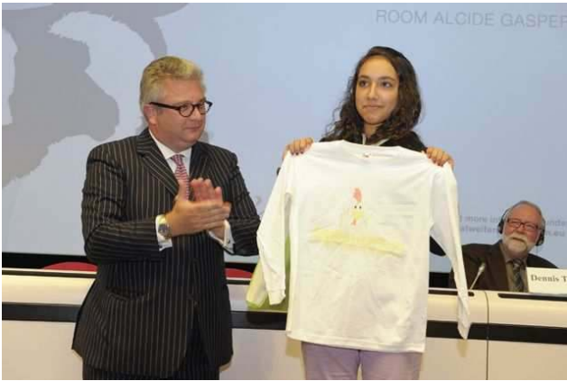
Prince Laurent applauds a young prize recipient