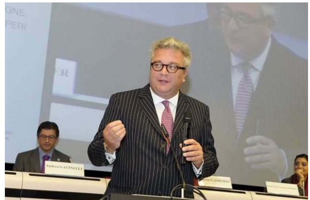
Prince Laurent of Belgium

only place to gain experience on how to handle and look after animals. He said that AISET believes that teaching young people about the importance of animal welfare will have a positive effect on their care and appreciation for animals and one another.