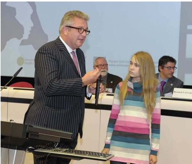
A highlight was the impromptu interview where Prince Laurent asked what this contestant thought was meant by “animal welfare”.